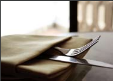
For consumers, eliminate the hassle of cash and checks, reduce wait time, enhance security, and improved user experience.