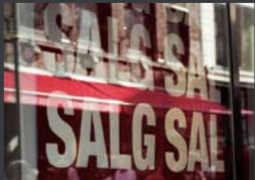
For merchants, reduce chargeback risks, protect your customers, increase revenues, add convenience, and build customer loyalty.