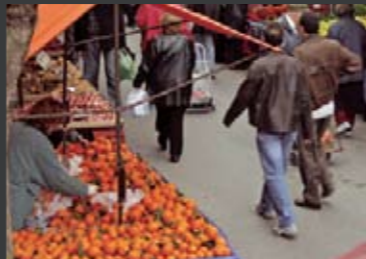
For bank and processors, open new markets and create more transaction opportunities.

Ready to make your move? Then go to www.verifone.com/wireless . VeriFone's global team is standing by with the turnkey solutions you need to go wireless.